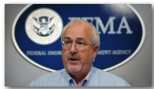
Craig Fugate, former FEMA Administrator

“We are better able to serve...when public sector and private sector representatives are both active members of the same team. FEMA believes in the value of public-private partnerships and has worked steadily to provide tools, models, and resources designed to inspire their creation and nurture their success.”