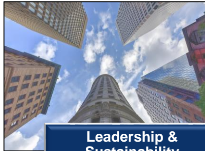
Leadership & Sustainability